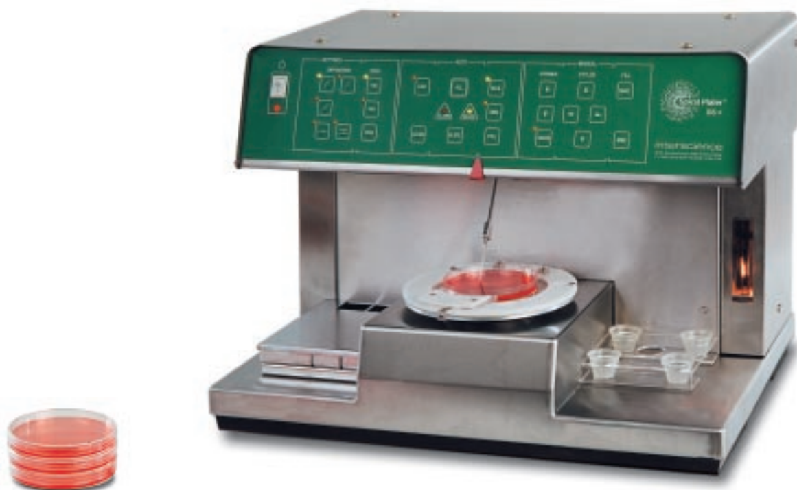
Spiral Plater® - Model DS Plus with microprocessor NF V 08-100 standard. Patent n° 9209765. Other patents pending.

The Spiral® method allows rapid bacterial enumeration while avoiding all or part of the intermediary dilutions.