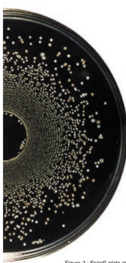
Figure 2 : Spiral® plate after incubation

AFNOR NF V 08-100 standard. Patent n°9209765. Other patents pending.