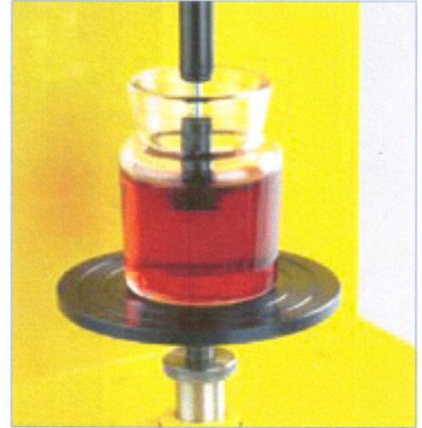
TABLE 1 LFRA Texture Analyzer Test Settings

Gel Strength in grams Bloom—peak force recorded during probe travel. In most gelatin, this is the same as hardness.