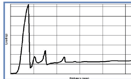
Figure 3: Testing on a weak package seal

The second graph (figure 3) shows test results of another product from the same manufacturer but a different production line. This seal behaved very differently. The initial peak force caused the package to fail abruptly