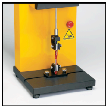
Figure 1: Dual Grip Assembly to imitate "tearing" or pulling motion

In order to test the packaging seals, which are usually at both ends, cutting around its middle must open the package. This leaves the seal intact so that it can be prepared for testing. To prepare a package seal for testing the package is cut into one inch strips. These strips can then be secured between a pair of grips with the seal in the center as shown in figure 1. It is important to secure the test strip carefully so that tensile force is applied evenly to the seal as the test begins.